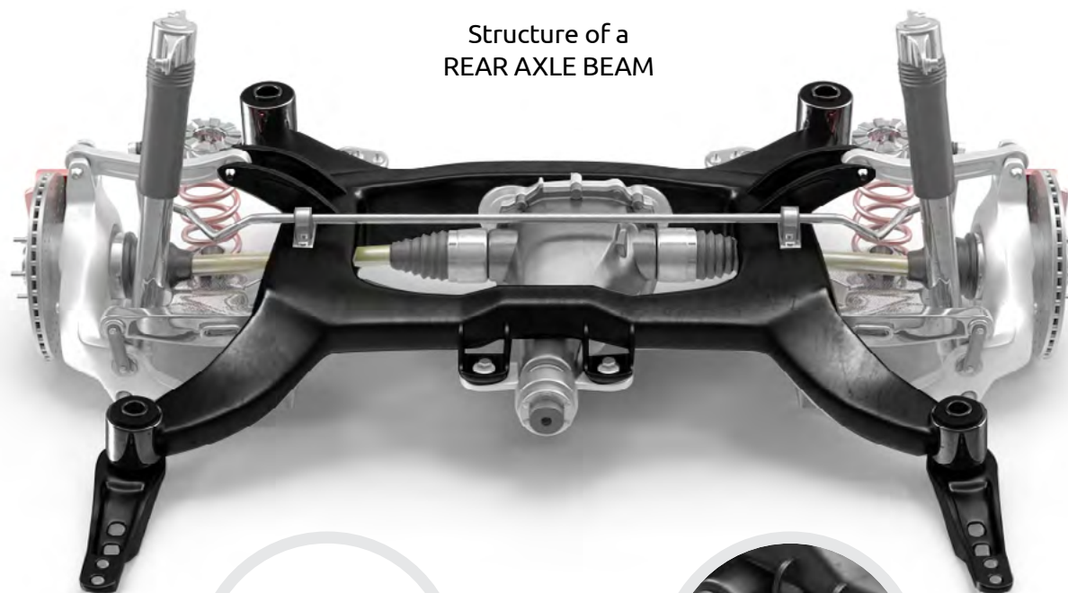
Structure of a REAR AXLE BEAM

Specially selected steel constitutes a solid basis for the construction of subframes and beams. Durable steel is a key to user safety.