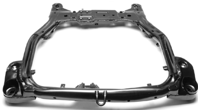
64SKV029 HYUNDAI • KIA

The SKV subframe cross-member has an additional function that is crucial in the event of a car collision. Namely, it constitutes a vital part of the controlled crumple zone . During a traffic accident, it absorbs a part of the impact force, becoming a key element of protection for the driver and passengers, vastly reducing the risk of serious injuries.